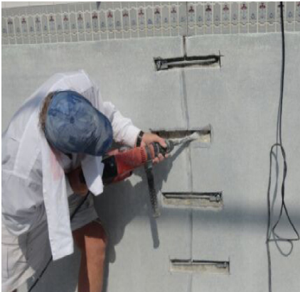
Repair work in progress