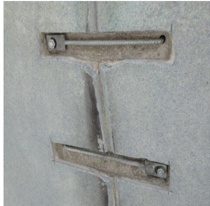
Fully stabilized fracture

Swimming pool professionals searching for proven products and techniques to repair concrete cracks are choosing the SlabStitch® concrete repair system. The system is engineered to transfer the load away from the crack creating a long-lasting fix. The system works by tightening down the precision mechanical stitch producing tension across the crack and inhibiting the fracture from expanding.